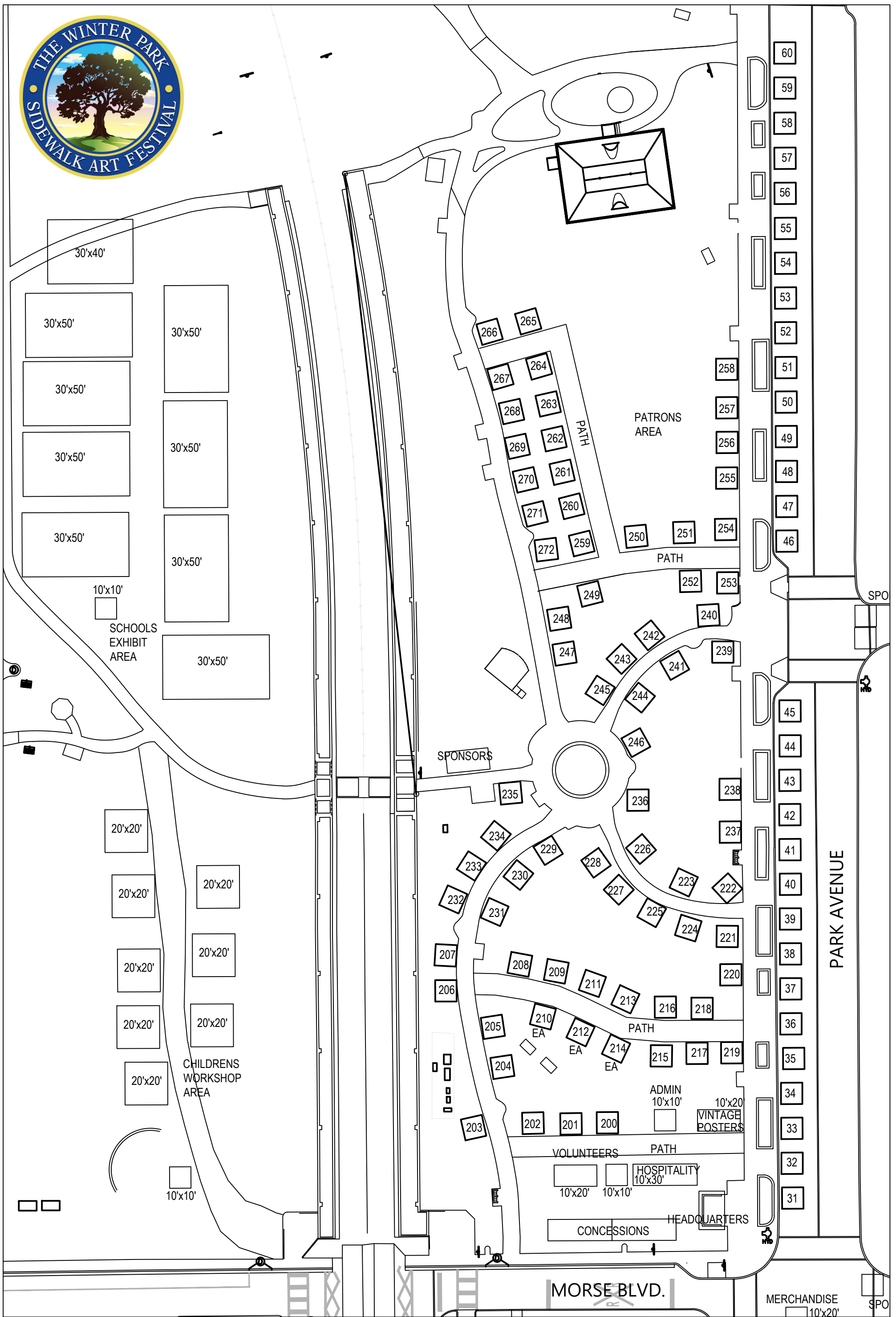
THE WINTER PARK SIDEWALK ART FESTIVAL - TENT LAYOUT, NORTH PARK 10-26-2022, 1" = 40'